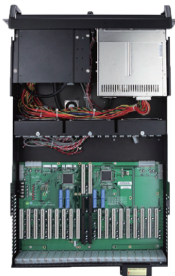
▲ Top view