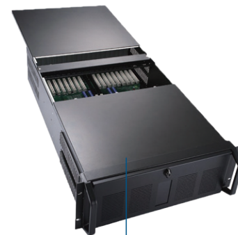
Dual top cover design for easy maintenance