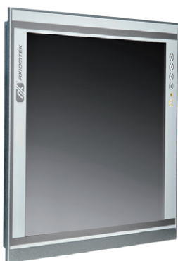
▲ Ultra-slim mechanism design